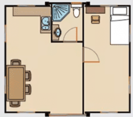
One Living room One Bedroom One Restroom