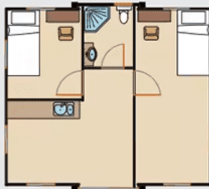
One Living room Two Bedrooms One Restroom