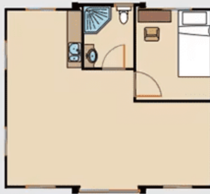
One Living room One Bedroom One Restroom