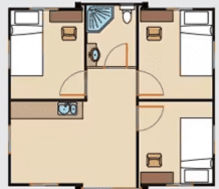
One Living room Three Bedrooms One Restroom