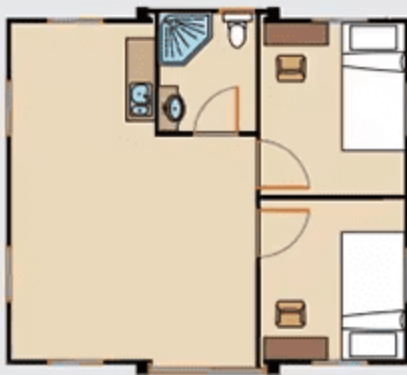
One Living room Two Bedrooms One Restroom